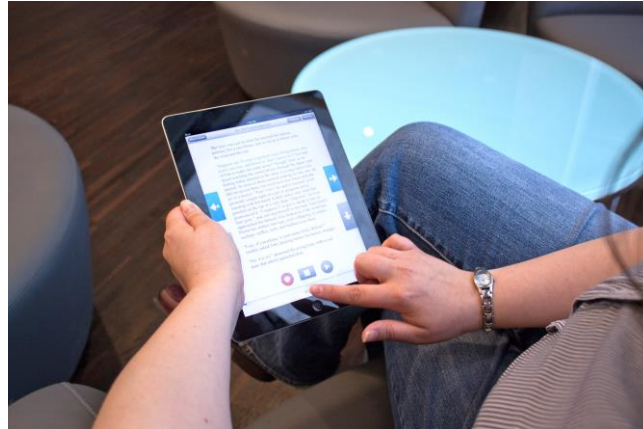
Fig. 1. ALLT e-reader prototype in use.

ing analysis. Second, it offered the ability to collect additional data through an embedded on-device questionnaire.