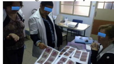
Figure 3: Photos using personal cell-phone to document physiotherapy results.

One important observation made during the design session with the physiotherapist (Feb 23, 2012) is that she disclosed that she had recently used the camera on her cell phone to take photos of one of her patients recovering from an injury. She was planning to show some of the photos at a conference. However, she decided to print the photos and put them in a photo album documenting healing progression. One day, she showed the album to her colleagues that stimulated discussion and how they could use this approach for their patients (Figure 3). As discussed below, this is an example of appropriation of the technology, suggesting that the camera interface itself has natural properties.