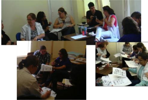
Figure 2: PD activity with health professionals.

abilities with ICT; all professionals had contact with touch technology, mobile phones and web search; none of them had contact with free-form gesture based technology. Our choice of PD was intended to avoid our own bias towards the use of WIMP interaction for some of the scenarios that were identified. We continued with PD-prototyping-evaluation until we arrived at five scenarios leading to three medium-fidelity prototypes.