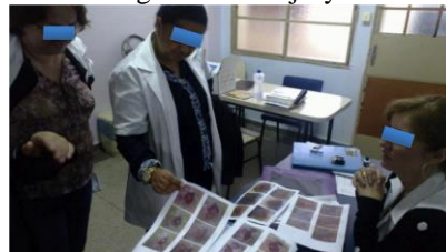
Figure 3: Photos using personal cell-phone to document physiotherapy results.

One important observation made during the design session with the physiotherapist (Feb 23, 2012) is that she disclosed that she had recently used the camera on her cell phone to take photos of one of her patients recovering from an injury. She was planning to show some of the photos at a conference. However, she decided to print the photos and put them in a photo album documenting healing progression. One day, she showed the album to her colleagues that stimulated discussion and how they could use this approach for their patients (Figure 3). As discussed below, this is an example of appropriation of the technology, suggesting that the camera interface itself has natural properties.