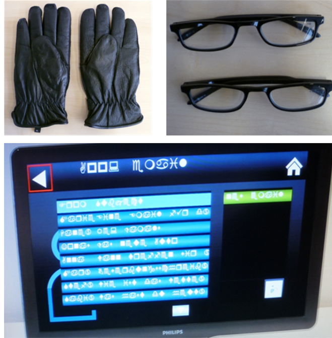
Fig. 1. Gloves, glasses and nonsense font (Wingdings) to systematically vary the benefits of user interface adaptations

For the example of the task “read email”, figure 2 shows how the four cost-benefit conditions were produced by different instructions and artificial barriers of use.