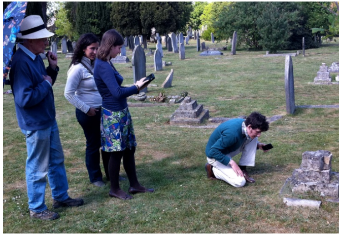
Fig. 2. Using mobile devices to look up database records and to photograph the graves

The photos that were taken by people outside could be uploaded in real time to appear on an interactive bird's eye view map of the cemetery displayed on the tabletop (see Figure 4). When indoors, participants were able to see photos being added onto the tabletop view of the graves – initially appearing in the form of coloured dots. Touching a dot resulted in bringing up the image taken there, and any information connected by the participants. The smartphones also allowed for texting and phone calls to be made between those inside and those outside in order to exchange information and generally plan the activity between group members. Live video images from a camera outside were shown on a wall display indoors, providing those indoors with a live roaming feed for allowing them to see what those outdoors were doing.