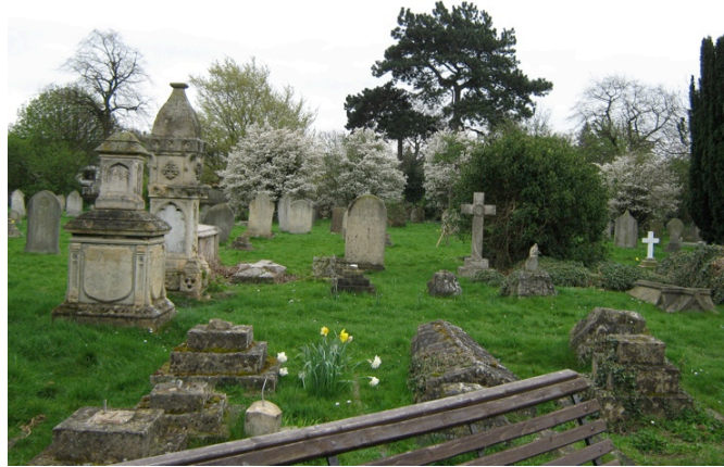
Fig. 1. Headstones in the cemetery

The cemetery (see Figure 1) is situated in a small city in the UK. There are around 20,000 burials in the cemetery, most in unmarked graves, with around 3,500 marked by headstones. Some of the headstones are very old, overgrown, and covered in lichen. The people buried there were from a variety of backgrounds and part of the pleasure of visiting the cemetery is to imagine and discover more about them.