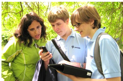
Fig. 5. School children showing their photos and describing their discoveries to a researcher in the cemetery

information on families, regiments and war locations. Throughout the afternoon groups around to enable all to switch between being indoors and outdoors. The volunteers in the cemetery started by photographing graves and then used the iPads to look up records in an attempt to link them together. They also interacted with the map on the tabletop indoors and guided the others outdoors on missing information.