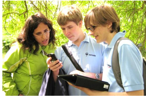
Fig. 5. School children showing their photos and describing their discoveries to a researcher in the cemetery

information on families, regiments and war locations. Throughout the afternoon groups around to enable all to switch between being indoors and outdoors. The volunteers in the cemetery started by photographing graves and then used the iPads to look up records in an attempt to link them together. They also interacted with the map on the tabletop indoors and guided the others outdoors on missing information.