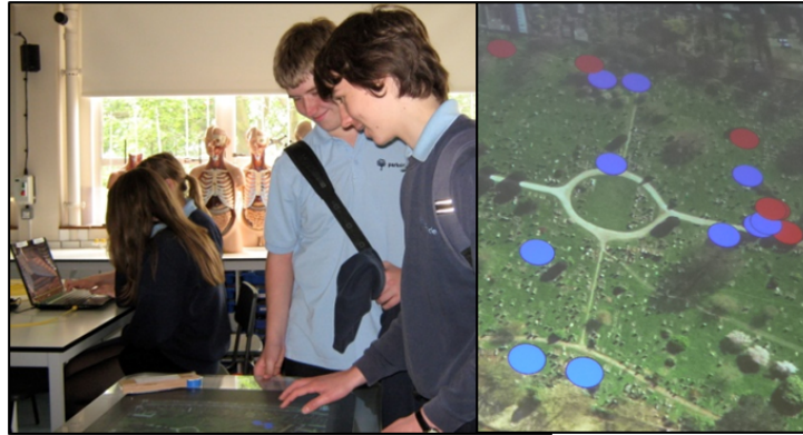
Fig. 4. Two pairs of students collaborating around the tabletop and laptops (left) and bird's eye view of the cemetery on the tabletop with dots representing the graves (right)

A shared content management system was created, based on the Drupal platform [14], which could be accessed from a wide range of devices to allow data to be up loaded and referred to from multiple locations. Accounts of the grave inscriptions and other parish records or copies of old newspaper clippings could be accessed. Other publicly available sources of information online, for example the digital records from the Commonwealth War Graves Commission, could also be accessed. The photos taken outdoors and the digital records were geo-referenced and mapped within the visualizations for the different devices. The GPS locations of the groups outdoors were automatically sent to a web server once every minute by the mobile phones. This location data was then displayed on the tabletop as part of the visualization. This enabled those indoors to see where the groups were outside as they moved around the cemetery. They could also see each photo they had collected, where they had collected it and any information each team had attached to that geo-referenced image.