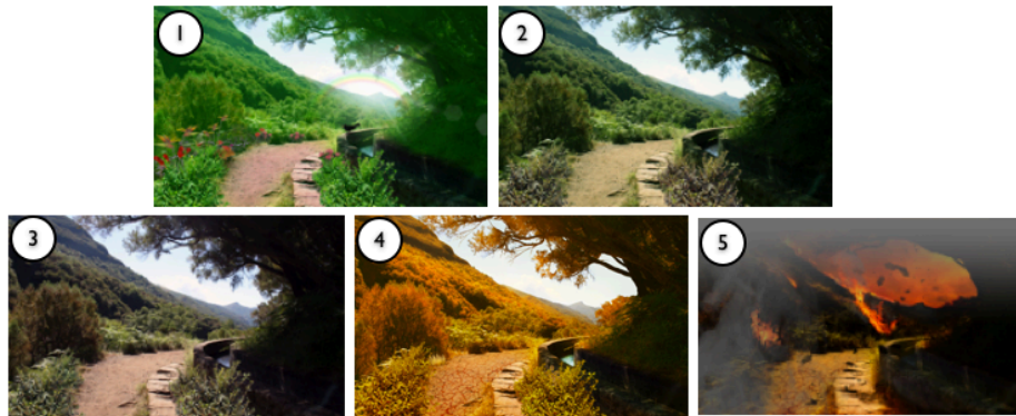
Fig. 5. Different views of the landscape according to the consumption. Ranging from low consumption (Image 1) to high consumption (image 5).

In total there were five levels of consumption represented in the forest (as shown in Figure 5). These five levels represent when an household consumption is slightly above/bellow, well above/bellow or belongs to the average baseline. The baseline was composed of an average of the consumption on that period, for example the real time consumption on a Monday at 12:20 was compared against an average of all the Mondays during the period between 12:00 and 13:00. Additional illustrations of the forest are used to ensure a smooth transition between the states, however the animation only stops in the five levels aforementioned.