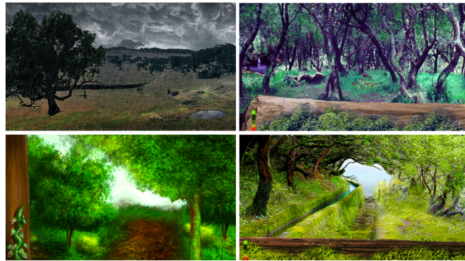
Fig. 4. Different landscape possibilities used during the think aloud process

Our eco-feedback system involves two main modes of operation. When it is not used for two minutes it goes into the Energy Awareness mode that shows the consumption mapped as a digital illustration of the local endemic forest. Once the user interacts with the tablet, by pressing the back soft key, the system goes to Detailed Consumption mode and shows daily, weekly and monthly information about the home energy use. It is important to point that Energy Awareness was the default mode of the system, the tablet never went to an idle mode like it happens by default in some android applications.