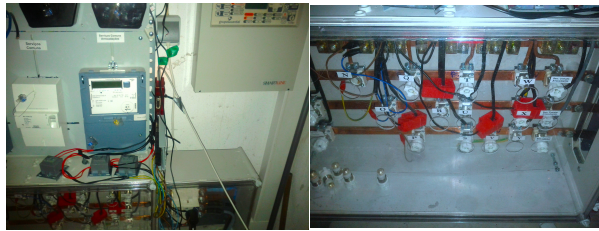
Fig. 2. Shows the system as it was deployed in one of the buildings of our study. At left there is the DAQ Board. At right there is the current clamp sensing each house.

tial prototype provided an easy way to deploy the system and evolve the visualizations during the first deployments. However, it was limited in terms of location (next to the mains at the entrance) and required installation inside the homes and unreliable Internet access. A second version of our system was implemented using a more capable DAQ (Data Acquisition Board) at the entrance of apartment buildings, hence measuring the energy consumption of multiple houses from one single location. This new version was less intrusive and enabled data to be pushed via web-services to different visualization platforms inside the home (web, tablets, etc.).