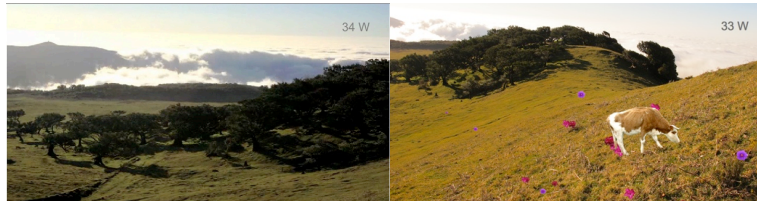
Fig 1. Screenshot of the application used in the pilot. At left there’s the main view of the forest, the consumption is mapped as the movement of the clouds in the background. At right there is the landscape with elements added based on the appliances used.

Three of the four families interviewed suggested that the concrete data provided by the first two versions should be merged with the aesthetic pleasure of the natural landscape shared this view.