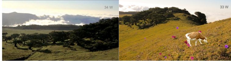
Fig 1. Screenshot of the application used in the pilot. At left there’s the main view of the forest, the consumption is mapped as the movement of the clouds in the background. At right there is the landscape with elements added based on the appliances used.

Three of the four families interviewed suggested that the concrete data provided by the first two versions should be merged with the aesthetic pleasure of the natural landscape shared this view.