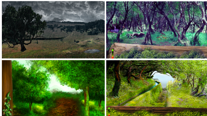
Fig. 4. Different landscape possibilities used during the think aloud process

Our eco-feedback system involves two main modes of operation. When it is not used for two minutes it goes into the Energy Awareness mode that shows the consumption mapped as a digital illustration of the local endemic forest. Once the user interacts with the tablet, by pressing the back soft key, the system goes to Detailed Consumption mode and shows daily, weekly and monthly information about the home energy use. It is important to point that Energy Awareness was the default mode of the system, the tablet never went to an idle mode like it happens by default in some android applications.