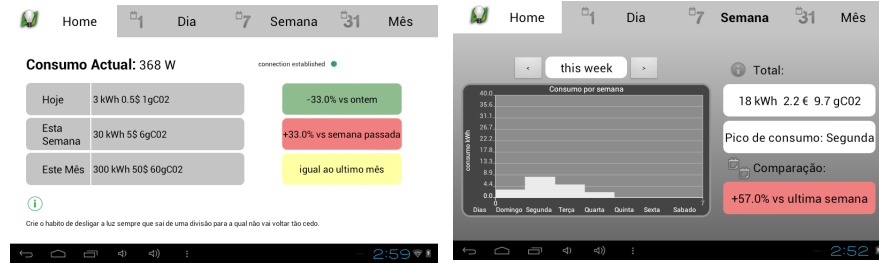
Fig. 6. Left: Home screen of the system. Right: Tab with the consumption of the current week.