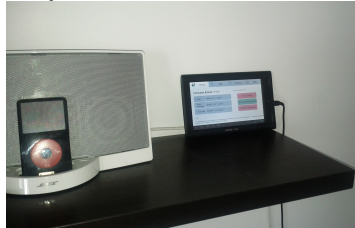
Fig. 3. System installed in one of the households.

users can still check their past consumption without an Internet connection. The transitions between the different modes of operation are stored locally enabling the analysis of the usage patterns by the research team. For example if a user picks up the tablet, presses the back button to go to the home screen and selects the daily consumption, the application will store 3 interactions with 3 different ids referring to the 3 different views accessed by the user.