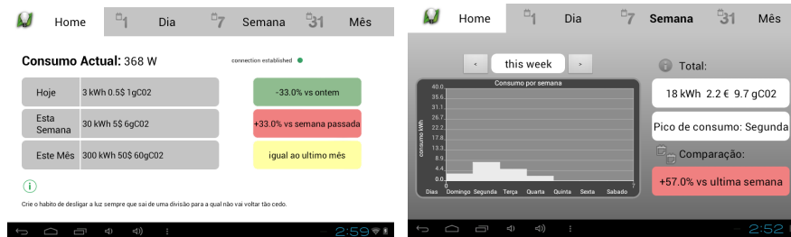
Fig. 6. Left: Home screen of the system. Right: Tab with the consumption of the current week.