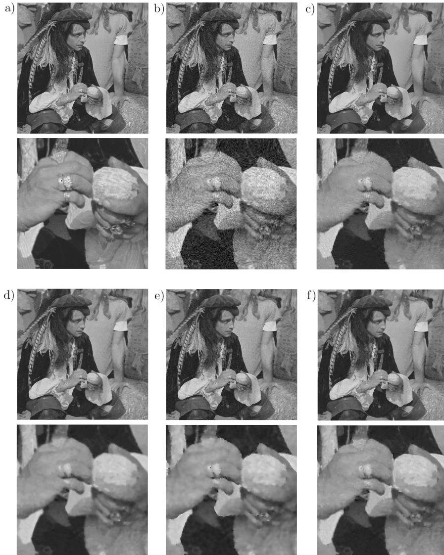
Fig. 3. a) Original image: 512 \times 512 (top) and 128 \times 128 (bottom) b) Noisy image: \rho = 15 c) NL-means: SSIM = 0.9245 d) Stochastic anisotropic diffusion: SSIM = 0.9246 e) Perona-Malik: SSIM = 0.9204 f) New method: SSIM = 0.9257