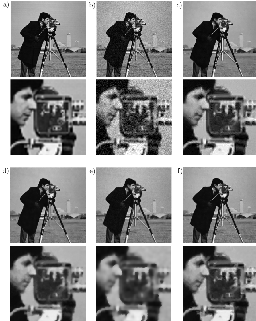
Fig. 4. a) Original image: 512 \times 512 (top) and 96 \times 96 (bottom) b) Noisy image: \rho = 20 c) NL-means: SSIM = 0.9214 d) Stochastic anisotropic diffusion: SSIM = 0.9144 e) Perona-Malik: SSIM = 0.8838 f) New method: SSIM = 0.9196