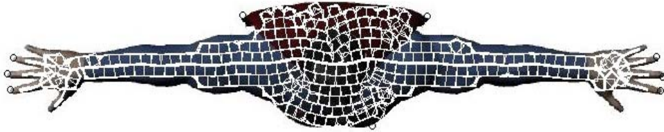
Figure 1 Watermarked blocks arranged across the Eulerian tours around the skeleton of the Superman top view.

A robust skeleton of each object is initially extracted in a vector form. To introduce enhanced noise resistance to the extracted skeleton, we use the Global-Local transformation [2] to map the noise contour back to a smoothed version. Starting then from the skeleton endpoints (marked as small circles in the images below), the pseudorandom watermark sequence is embedded in the DCT domain of the blocks along the skeleton's Eulerian tour. When the first tour is completed the Eulerian tour is extended outwards, in consecutive layers towards the object's boundary until the watermark sequence is spread to the whole object. During watermark detection, initially the skeleton of the candidate object is extracted and the potentially watermarked blocks that are located along the extended Eulerian tour are matched against the respective blocks around the initial skeleton. Only tours starting from the skeleton endpoints are examined. The success of the method stems from the fact that based on the Global-Local transformation, the robust skeleton is extracted from a smooth version of the original contour that retains certain metric information.