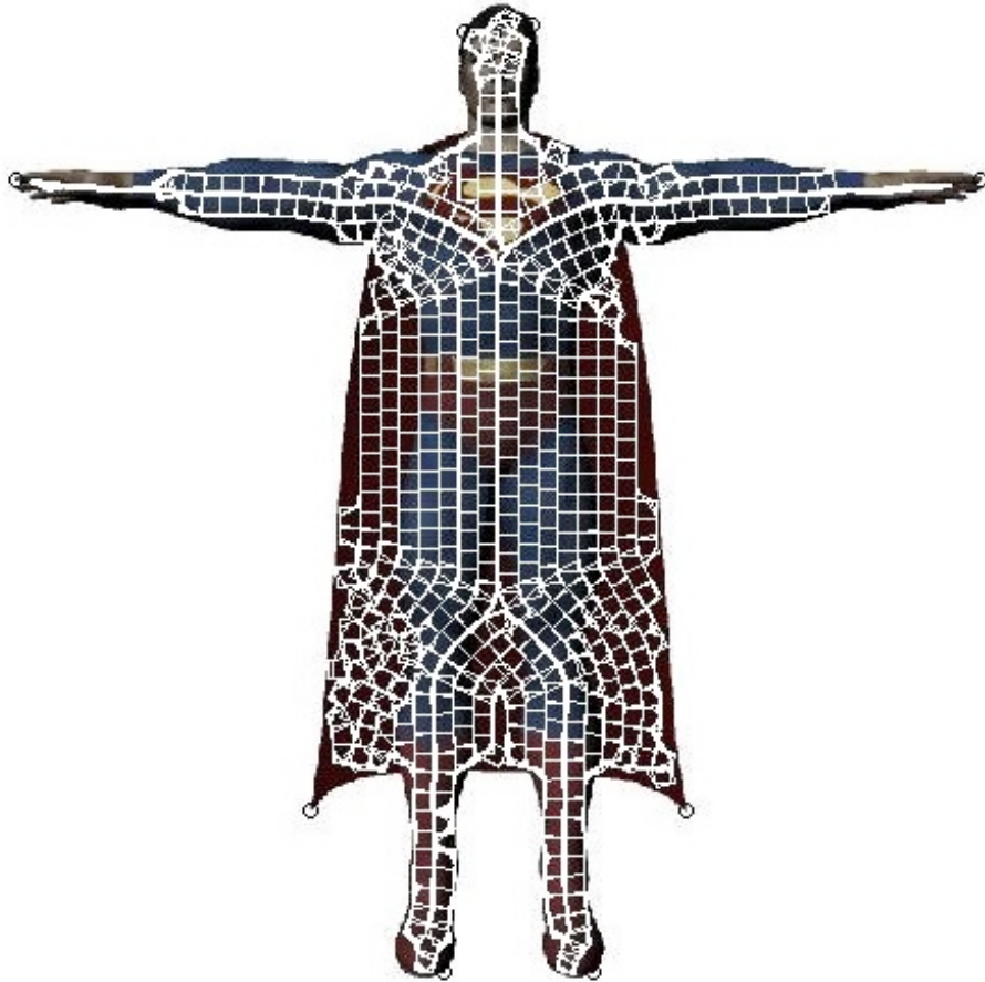
Figure 2. The location of the watermarked blocks arranged in layers around the skeleton is illustrated for the Superman figure.