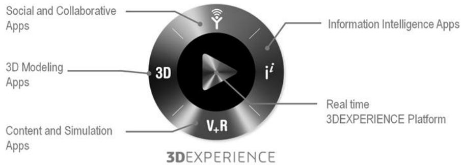
Fig. 3. - 3DEXPERIENCE Platform Compass