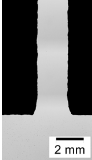
Fig. 3. Cross-section of a laser generated wall of INCONEL718

Standard welding feedstock wires can be used as deposition material. The suitable wire diameters range from about 1.2 mm down to 0.3 mm. Using the fine wires, the best lateral resolution of the generated structures lie in the range of 0.6 mm. Here the deposition rate amounts to 30 cm 3 /h.