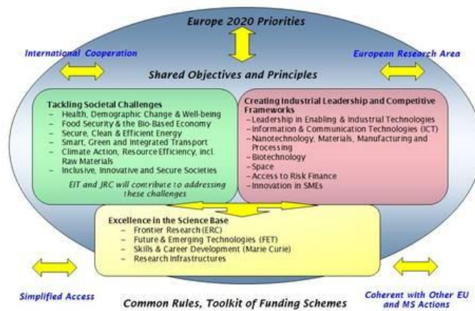
Fig. 3. The Horizon 2020 Framework Programme

The next EU Framework Programme for research and innovation, called Horizon 2020 7 , directly supports the policy framework of Europe 2020. It is due to start on 1 January 2014 and to run over seven years with a total budget of around 80 billion, according to the European Commission's proposal. The proposal is currently under debate in the