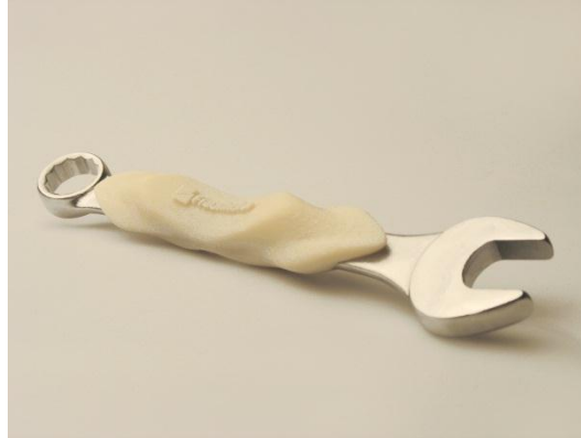
Fig. 1. Embedded wrench