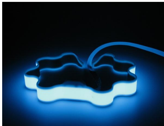
Fig. 2. AM part with integrated EL-Foil and Converter