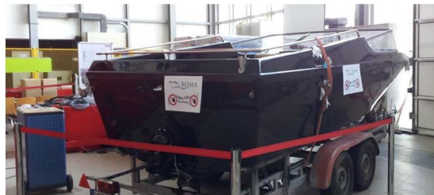
Fig. 7. - Prototype boat for sensor integration and testing

The final stage, UMG Prototype MK. III (see Figure 7), consists of a fully functional and live size boat where a set of sensors, based on the findings of the earlier stage tests, is implemented. This prototype will be tested under realistic settings and different scenarios.