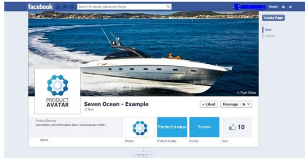
Fig. 3. - Screenshot of the Facebook Product Avatar for the Usage phase (MOL)

The Product Avatars main function in this phase was, to provide pre-defined (information) services to users. The PLM information needed were either based on a common data base where all PLM data and information for the individual product were stored or derived through a mediating layer, e.g. the Semantic Mediator (Hribernik, Kramer, Hans, Thoben, 2010), from various available databases. Among the services implemented was a feature to share the current location of the boat including an automatic update of the weather forecast employing Google maps and Yahoo weather. Additionally, information like the current battery load or fuel level were automatically shared on the profile (adjustable by the user for data security reasons). (see Figure 4)