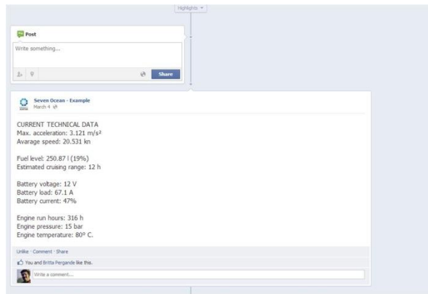
Fig. 4. - Screenshot of an excerpt of information provided by the Product Avatar

The Product Avatars main function in this phase was, to provide pre-defined (information) services to users. The PLM information needed were either based on a common data base where all PLM data and information for the individual product were stored or derived through a mediating layer, e.g. the Semantic Mediator (Hribernik, Kramer, Hans, Thoben, 2010), from various available databases. Among the services implemented was a feature to share the current location of the boat including an automatic update of the weather forecast employing Google maps and Yahoo weather. Additionally, information like the current battery load or fuel level were automatically shared on the profile (adjustable by the user for data security reasons). (see Figure 4)