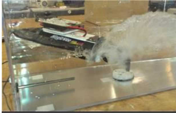
Fig. 6. - UMG Prototype Mk. II „in Action“

The final stage, UMG Prototype MK. III (see Figure 7), consists of a fully functional and live size boat where a set of sensors, based on the findings of the earlier stage tests, is implemented. This prototype will be tested under realistic settings and different scenarios.