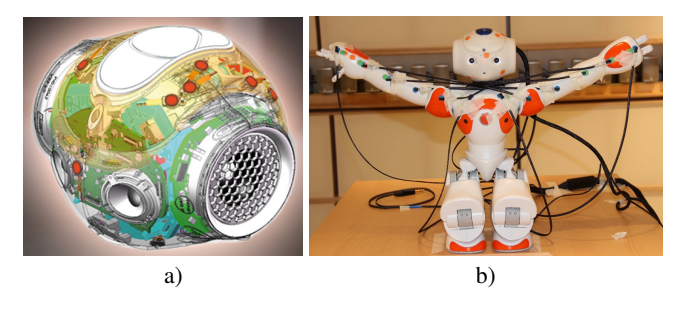
Fig. 2. a) Design drawing of the new 12-microphone prototype head, b) NAO robot with new prototype head and robomorphic array.

The head microphone array might be extended by mounting mi-