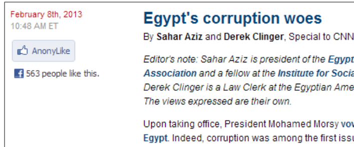
Fig. 2. Example of a post with the associated anonyLike button and the number of (anonymized) people that "liked" that post.

Homomorphic Encryption We say that \epsilon is a (\oplus, \otimes) -homomorphic encryption scheme if for any instance E of the encryption scheme, given c_1 = E_{r_1}(m_1) and c_2 = E_{r_2}(m_2) , there exists an r such that c_1 \otimes c_2 = E_r(m_1 \oplus m_2) . This property is crucial in the anonyLikes protocol to calculate the number of "likes" (sum) of a given post without having to decrypt individual "like" messages. The ElGamal cryptosystem satisfies this property for multiplication operations, so we need to use a variant known as exponential ElGamal [9] that satisfies this property for additive operations, i.e. c_1 * c_2 = E_r(m_1 + m_2) .