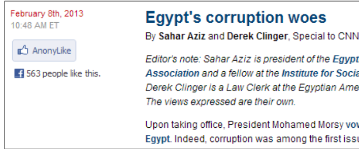
Fig. 2. Example of a post with the associated anonyLike button and the number of (anonymized) people that "liked" that post.

Homomorphic Encryption We say that \epsilon is a (\oplus, \otimes) -homomorphic encryption scheme if for any instance E of the encryption scheme, given c_1 = E_{r_1}(m_1) and c_2 = E_{r_2}(m_2) , there exists an r such that c_1 \otimes c_2 = E_r(m_1 \oplus m_2) . This property is crucial in the anonyLikes protocol to calculate the number of "likes" (sum) of a given post without having to decrypt individual "like" messages. The ElGamal cryptosystem satisfies this property for multiplication operations, so we need to use a variant known as exponential ElGamal [9] that satisfies this property for additive operations, i.e. c_1 * c_2 = E_r(m_1 + m_2) .