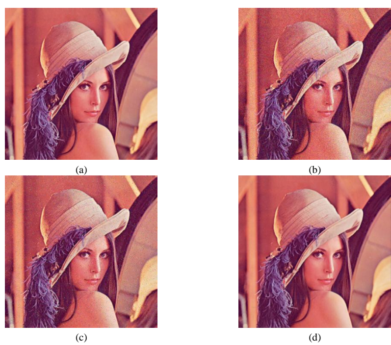
Fig. 6. The results of watermarked image from (a) JPEG image compression, (b) Gaussian white noise 0.01, (c) Salt and pepper 0.02 and (d) 3\times 3 Gaussian low pass filter