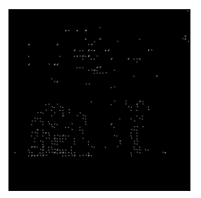
Fig. 5. An enhance absolute difference between the original image and the watermarked image