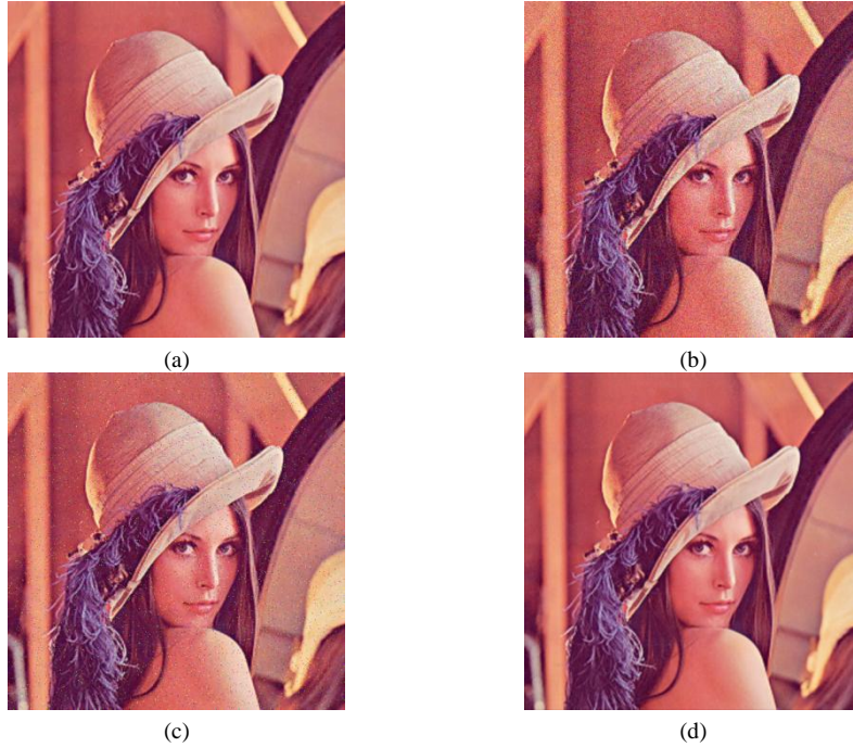
Fig. 6. The results of watermarked image from (a) JPEG image compression, (b) Gaussian white noise 0.01, (c) Salt and pepper 0.02 and (d) 3×3 Gaussian low pass filter