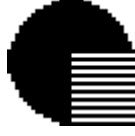
Fig. 4. Original watermark image consists of 32×32 pixels

The edge of a host image is computed using Canny edge detection to determine the edge location [11]. A sample Lena image is divided into blocks, each block consists of 8×8 image pixels. The host image is embedded a one-bit watermark for each edge image. The Random Numbers Generator (RNG) is an important computation in term of embedding process to generate the random numbers based on a secret key. The secret key is employed to encrypt and decrypt the watermark during watermark insertion and extraction. This paper implements mersenne twister method to generate random numbers for the embedding watermark scheme.