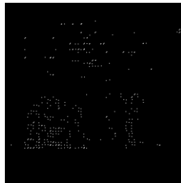
Fig. 5. An enhance absolute difference between the original image and the watermarked image