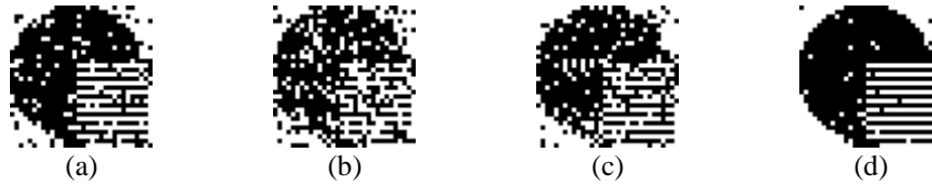
Fig. 7. The extracted watermark image after from (a) JPEG image compression, (b) Gaussian white noise 0.01, (c) Salt and pepper 0.02 and (d) 3×3 Gaussian low pass filter

Human visual system and its sensitivity are utilized in the design of this embedding watermarking scheme. The advantages of this watermarking scheme are the watermark image is perceptually invisible to the human eye and robust to non-malicious attacks. The destroying the image edge will remove the watermark. It also means that the quality of the host image will be damaged considerably.