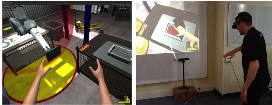
Fig. 1. Avatar’s hands trying to pick-up the part from the robot (left) and user trying to put the part in the metallic die (right).

In this paper a serious game application named “BeWare of the robot” is presented, simulating tasks of human-robot collaborative tape laying for building aerospace fabric reinforced composite parts. Profiled fabric layers (patches/cloths) are stacked successively inside a die, one on top of the other, until the desired thickness is reached.