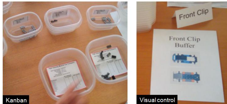
Fig. 1. Lean manufacturing concepts illustration