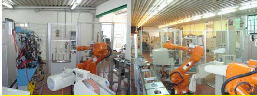
Fig. 2. Overall views of robotic cell A (left) and of robotic cell B (right)

In the robotic cell A, first some manual operations are performed: a human operator picks the semi-assembled shoe from its trolley and puts it in a conditioning unit (nr. 8); after that operation, the operator places the last in front of an RFID station for the automatic setup of the toe lasting machine (nr. 9), performs the toe lasting operation, and then places the last in the man-robot exchange station (nr. 11), which is also a conditioning unit. Then, a manipulator is used to pick the last from the man-robot exchange station, place the chip of the last in front of a second RFID station for the automatic setup of the heel seat and side lasting machine (nr. 13), load and unload that machine, and finally place the last in the pallet conveyor.