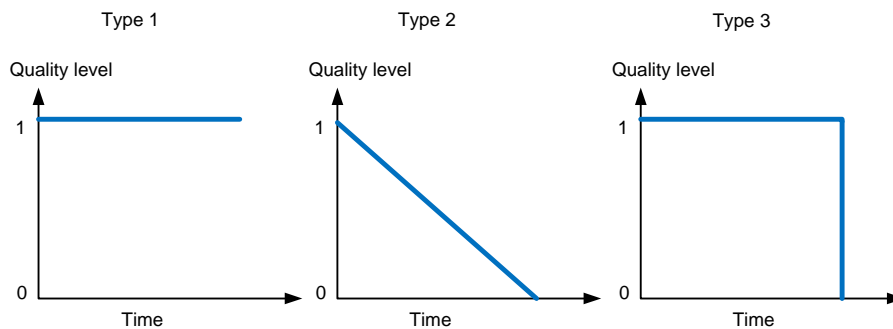
Fig. 2. Three basic quality level categorisations inspired by [5; 19]

The categorisation of the quality level is inspired by Ferguson and Koenigsberg [5], Talluri and Ryzin [19], and the retail case study. As illustrated below in figure 2 the quality level can be categorised into three main types based on the characteristics of the products, as it is believed to be representative for all product types.