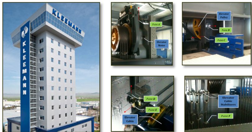
Fig. 2. WelCOM Testbed Planning

The development of WelCOM's mobile client drives an assessment of direct and indirect methods for inferring maintenance related contexts. One of our main tested sites is the Kleemann's lift testing tower. This tower is equivalent to a seventeen floor building, and comprises four testing units. The WelCOM intelligent advisor should be able to monitor, map and analyze a set of condition parameters related to lift operational parts and components (Fig. 2). The lift testbeds themselves are technical structures composing an integrated lift machinery installation.