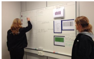
Fig. 2. Obtaining organizational learning through team boards

Current layout in the production line gives challenges in achieving transparency in the value chain. The production area is divided into sections where the operators are working in separate compartments which affect the information flow. The operators are not familiar with working in teams. Moving towards industrialization (knowledge stairs), it is necessary to formalize the information flow. To improve the transparency in the production area and create a learning environment with common arenas for information sharing and collaboration, team boards were introduced as the first step in a PMS implementation process. However, interviews and field studies revealed some resistance to this process.