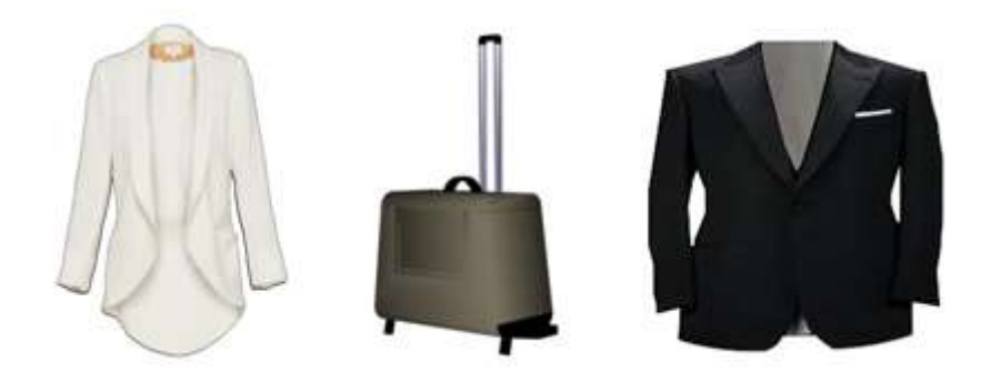
Fig. 2. Indicative example of designed ladies coats, suitcases, and tuxedos displayed in laboratory store layouts