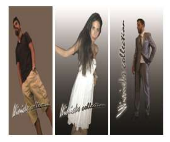
Fig. 4. Indicative images of models displayed in the walls of the laboratory store layout types

The same brand name was used in each store layout type for internal validity purposes of the forthcoming laboratory experiments. Clothing displayed in each store was named "Winick's Collection"; it comes from the first name of one of the researchers' avatar in the Virtual World Second Life since 2008, which is Winick Ceriano. The practice of displaying images of real world models to promote products, in walls of a 3D store, is common in Virtual Worlds retailers' stores. Copying images from models appeared on the Internet or 3D stores was not an option because of copyright permissions. To avoid this difficulty, one of the researchers captured images with an iPhone 4s mobile device, from six individuals who approved for their images to be displayed around each laboratory store layout. The final editing of the images was developed through Adobe Photoshop CS6. The images of the models are presented in figure 4.