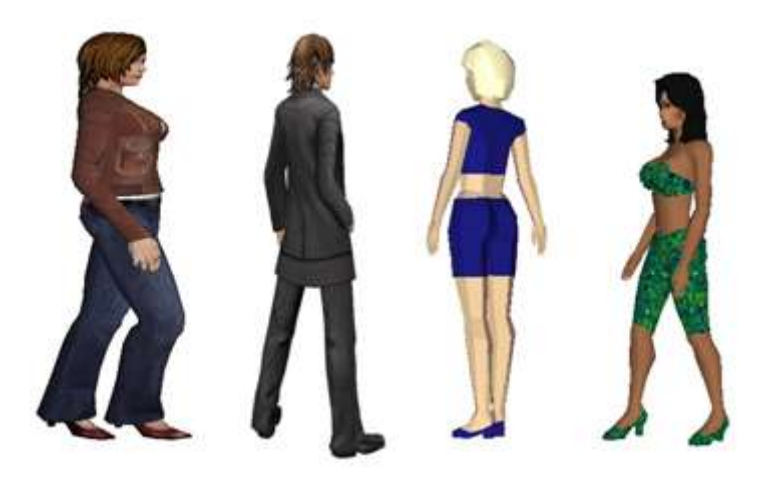
Fig. 3. Indicative example of designed complete avatars' outfits displayed in laboratory store layouts

As far as the allocation of products within each store is concerned, specifications coming from the Delphi method results, determined merchandise allocation guidelines in each store separately. Specifically, at the first-round of the Delphi, a panelist introduced the theme-based and similar-based allocation of products; these terms were validated from all panelists in the second-round Delphi. Theme-based display of products refers to a practice where products of the same category (e.g., shirts) are located in the same place in a part of the store, one next to the other. Similar-based display refers to the practice where complete outfits (e.g., shirt, jeans, belt, socks and shoes) are displayed, the one next to the other. The first practice serves the ease of searching among products of the same category, while the second serves matching an outfit's parts.