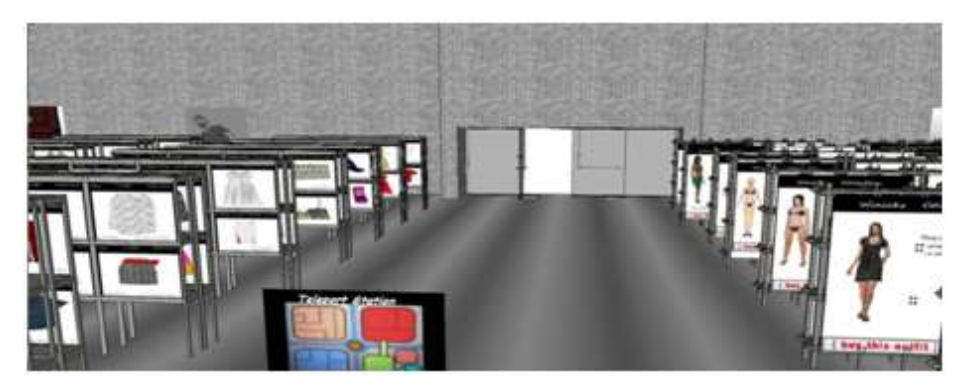
Fig. 9. Teleporting Station