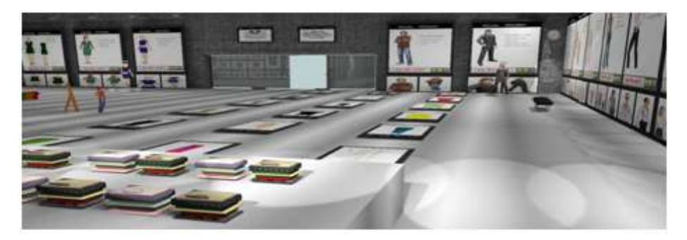
Fig. 6. Screens in the floor plan to increase space