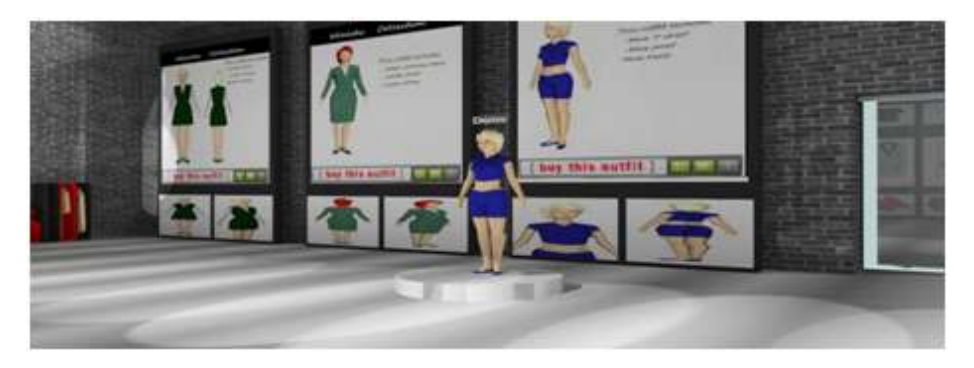
Fig. 5. View of a demo model