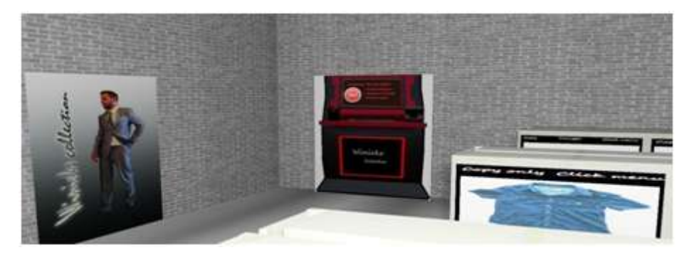
Fig. 8. Customer Service Kiosk (Contact designer info/compare products)