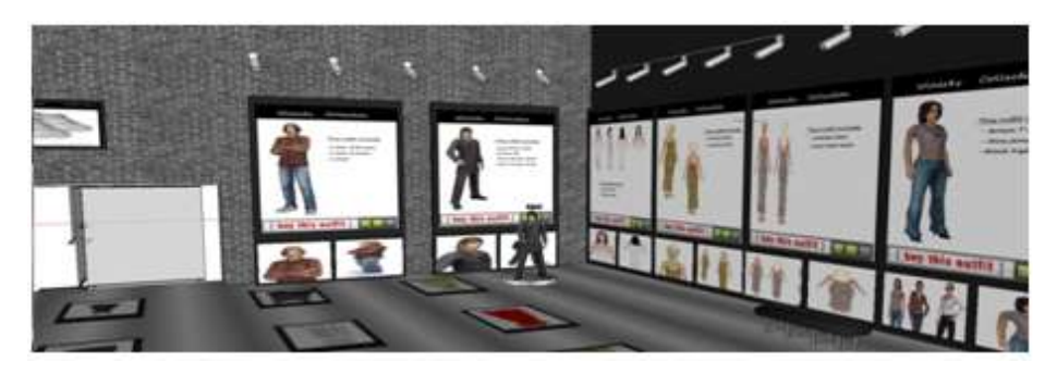
Fig. 7. Images on the walls leaving space for model display