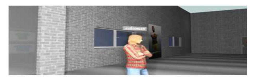
Fig. 10. Salesman