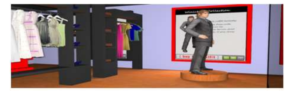
Fig. 14. Demo products