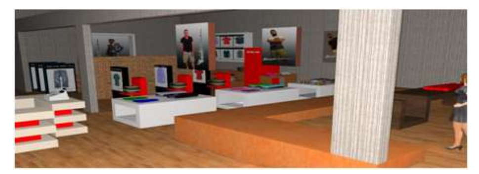
Fig. 18. Simulation of traditional allocation of products