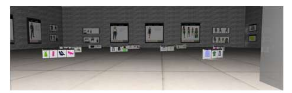
Fig. 13. Inexpensive approach with extra display walls