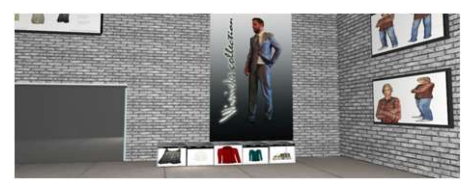
Fig. 11. "Wall" items