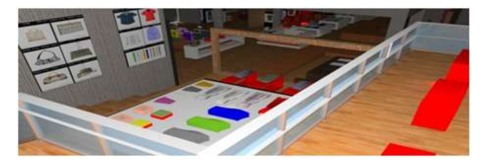
Fig. 17. Similarities to traditional stores regarding space layout