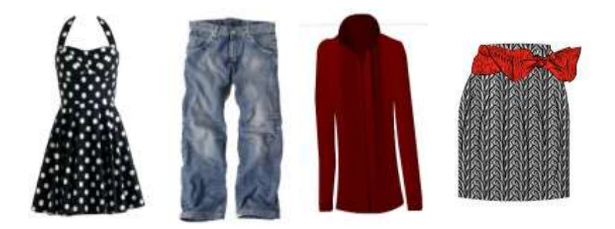
Fig. 1. Indicative example of designed dresses, jeans, shirts, and skirts displayed in laboratory store layouts

Second Life is considered one of the leaders in virtual worlds [13]. To finalize the list of product categories that would be offered in the 3D online experimental stores of this study, it was considered appropriate to use the search engine for places in Second Life and visit the ten top listed apparel stores. These places are likely to be the most crowded and "famous" places. However, an obstacle that this study had to face is that the products offered in the stores visited in Virtual worlds, could not be copied and used for the scope of this study, because of copyright permissions. To overpass this obstacle, it was decided to use products offered in the Database of Google SketchUp 8. However, the variety of products offered by this program is limited. The use of Adobe Photoshop CS6 assisted to design clothes which are based on the products offered by Google SketchUp, but look quite different. The final database of the products developed was entirely used in almost all store layout types. The variety of products designed and used in the laboratory stores are: Dresses, Trousers, Ladies coats, Shirts, Shoes, Skirts, T-shirts, Ties, Tuxedos, Ladies' bags, Suitcases, Complete outfits (A common trend for retailers in 3D online retail stores is to sell complete formal or casual outfits). Indicative examples are presented in Figures 1,2 and 3: