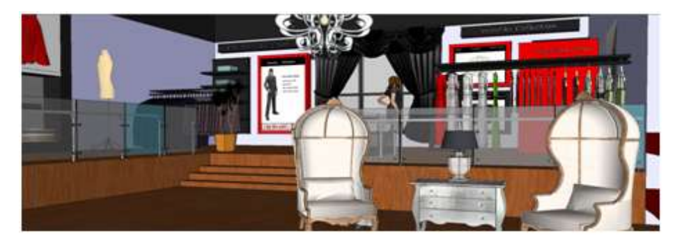
Fig. 16. Attractive materials/appeals to residents