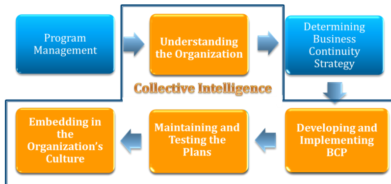
Fig. 1. BCM lifecycle elements which can be supported by CI are highlighted

Based on the BS25999 Business Continuity Management (BCM) lifecycle and existing applications of Collective Intelligence [BS25999 (2006)], we reckon that Collective Intelligence can support some BCP elements, as shown in Figure 1.