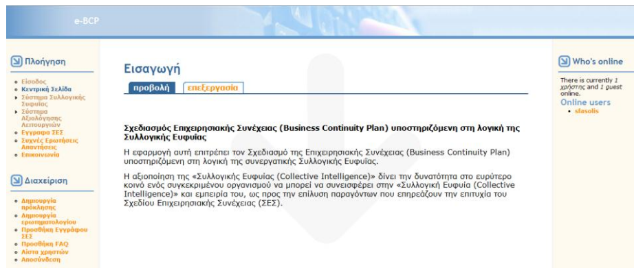
Fig. 2. A screenshot of the E-BCP platform

As a proof of concept, a collective intelligence platform was designed and developed (www.e-bcp.eu) enabling the users community within an enterprise in Greece to contribute their collective experience and intelligence to resolve factors that affect the success of the BCP. A screenshot of the platform (Greek version) is given in Figure 2.