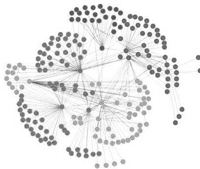
Fig. 2. Scale Free network: Small number of nodes with high degree and a large number of nodes with low degree

Scale free structure: The degree distribution shows a scale free structure that is a heterogeneous network topology encompassing a relatively small number of nodes with exceptionally high degree and a very large number of nodes with low degree (figure 2). One remarkable feature of scale-free networks is that they are highly robust against random errors but on the contrary they are highly vulnerable to attacks targeting nodes which serve as hubs in the network. The scale free modeling lays the emphasis on the network dynamics and its main objective is to model the process that underpins the evolution of complex networks since such an approach will lead to the creation of networks with the correct structure [20, 25].