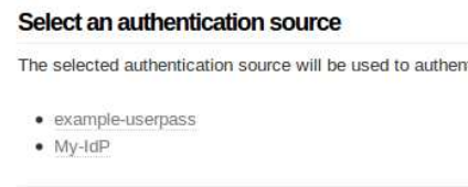
Fig. 5. Linked untrusted IdP as the authentication source in the proxy IdP.