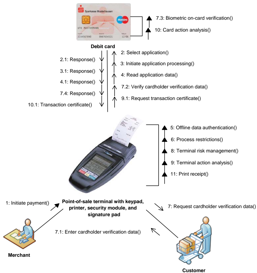
Fig. 1. Communication diagram for offline EMV transactions with biometric on-card verification

Offline data authentication: This step is performed if both the terminal and the card support offline checking of the validity and integrity of the data stored on the chip. Different methods based on public/private key pairs are defined for this purpose: