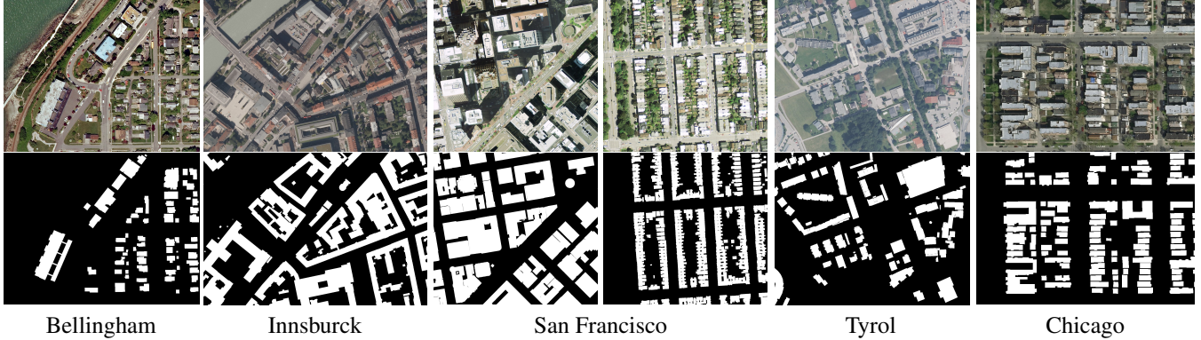
Fig. 2: Close-ups of the dataset images and their corresponding reference data.

and low-density (e.g., Kistap/Bloomington, West/East Tyrol) urban settlements. While aerial images over Tyrol are present in both subsets, they have been obtained at different flights over the country, thus showing different illumination characteristics. We have also selected dissimilar images inside some of the groups (e.g., Kitsap County contains tiles from two different flights with very dissimilar characteristics). The reference data was created by rasterizing the shapefiles with GDAL. Fig. 2 shows closeups of the images in the dataset.