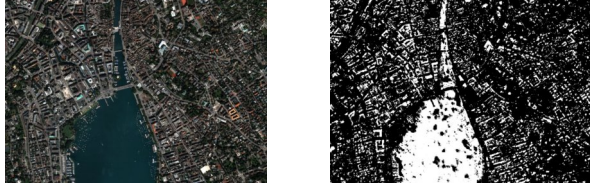
Fig. 1: A state-of-the-art CNN trained on a different dataset misclassifies most of Lake Zurich as a building.

can observe Lake Zurich being mostly classified as building . Even though there were buildings and body waters in the French imagery, the CNN seems to have learned what a building looks like in that particular imagery and not simply what a building looks like.