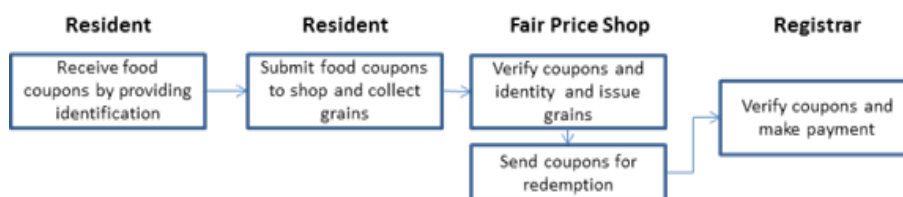
Fig 1: A sample usage of Aadhaar in food distribution process

While the technological and implementation challenge of enrolling and providing IDs to 1.2 billion is broadly acknowledged, the common opinion is that UID is otherwise a very simplistic problem of a unique 12-digit number. But the achievement of the development objective is dependent on a base infrastructure consisting of connectivity, financial inclusion and identity on which various government and private agencies would build their own applications and platforms. This requires Aadhaar to have a taken-for-grantedness for identity management. As the extensions of the Aadhaar infrastructure are context dependant, various stakeholders like government agencies (registrars), regulators, residents, etc. are involved. We provide two examples below to highlight the possible variations. The Madhya Pradesh state government has reengineered its food distribution processes based on Aadhaar and has built the MPePDS platform for its food distribution system (MPePDS, n.d.). Figure 1 shows the proposed MPePDS process where the identity verification is done offline.