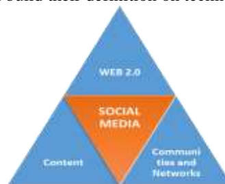
Fig. 2. Three key elements of social media [9]

There are many definitions of social media – it is possible to define social media from the user, content, business or technological perspective [7]. Figure 2 shows such triangle of content, technological and sociological aspect of social media. Andreas Kaplan and Michael Haenlein in their paper define social media as „a group of internet-based applications that build on the ideological and technological foundations of Web 2.0, and allow the creation and exchange of user-generated content.“ [8] In other words, Kaplan and Haenlein build their definition on technological aspect.