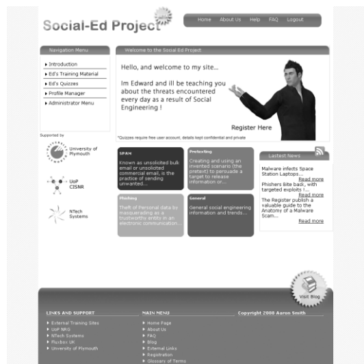
Figure 1 The main interface of the Social-Ed site.

Within the context of this design, the Social-Ed website focused on providing a conceptual educational experience, whereby users are presented with material in a form which they can relate to, adding to this is the availability of interaction through the quizzes which can improve the effectiveness of learning skills [11].