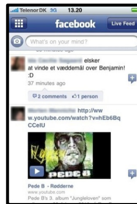
Fig. 1. Example of probe response picture

From an analytical perspective, the Mobile probe method objective was not to reach a single unambiguous answer or solution, but rather the responses should let the researcher become inspired by the participants [1]. With the aim to support the project's rigidity in the analysis phase, while keeping a user-centric focus, user experience goals and cognitive process variables were applied to the analysis. The cognitive processes were identified as: attention, perception & recognition, memory, learning and problem-solving, planning etc. The user experience goals were identified, as: satisfying, enjoyable, provocative, boring, etc. (All derived from [9]).