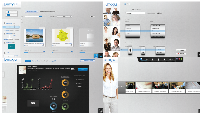
Fig. 4. Some screenshots of Umagus (projects, dashboard, persona and journey creation).

As part of a research and development project on the transformation process through services, and in order to implement the second building block of our framework (softwares and tools) which is still not completely addressed, we have worked on the conception of a specific tool and its database called Umagus (figure 4). Umagus aims to scale up and shift from the current handmade approach to an industrialized approach with a structured and semi-automated process. In its first version, it is a web-based platform to support the innovation process and keep the value of its findings and productions. Technologically speaking, it has been developed as a SaaS platform with a graph-database given the nature of the studied phenomena as heterogeneous and interconnected entities [14] and given the few constraints of this kind of database which does not require joint relationships between pre-established tables and which can store a huge amount of data.