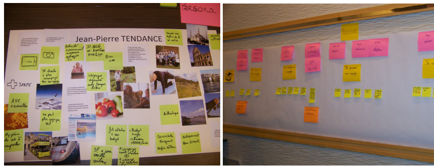
Fig. 2. Examples of handmade persona and customer journey.

To do Service Design [4], most of actors regularly use a common set of tools and methodologies such as personas, customer journeys, stakeholders mappings, service blueprints, prototyping (storyboards, mockups, aso.) and business model canvas. This Service Design methods and models are often used during collaborative workshops to find opportunities/ideas and/or to conceive a service. They vary from phase to phase. Sometimes the tool is an outcome that may be used directly all along the innovation and the delivery process (eg. Personas). Sometimes the tools are just a way to achieve a step (eg. stakeholders maps). But they all are rich findings and productions gathering a lot of information and knowledge that are lost or unused due to the nature of the materials (post-it, paper, etc.) and the temporary nature of the moment (fig.2).