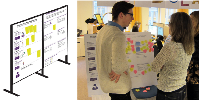
Fig.2. The second generation of method 2 was tested on employees in the customer support. Method 2 became a meeting point for TD and the ABC Company. The boards created a curiosity among the staff and this led to new dialogues between the different departments.

During the tests of method 2 the boards were placed in both stores and in the customer support office. In the shops the boards were cramped in to already minimal coffee and lunch rooms therefore they were hard for the employees to use. But in the office of customer support the boards could take a more central role. It was placed on the middle of the customer service staff workroom, where it was visible from all sides.