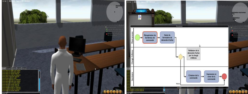
Figure 1 Screen shot PEGASE: player interacts with its environment