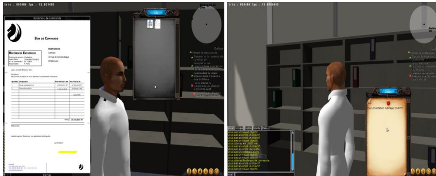
Figure 2 Screen shot PEGASE: player collects product data

This project was a success by showing that we can improve change management by using a Serious Game. However, the construction of a Serious Game is very expensive, it does not fit the limited funding of a small and medium sized company.