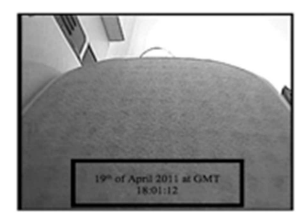
Figure 6. Customized AVTECH DVR video snapshot using MPlayer.

tions such as resolution, aspect ratio and frames per second can also be obtained from the video header data.