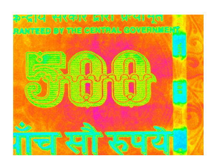
Figure 2. Image IMG_11.