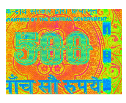
Figure 1. Image IMG_10.