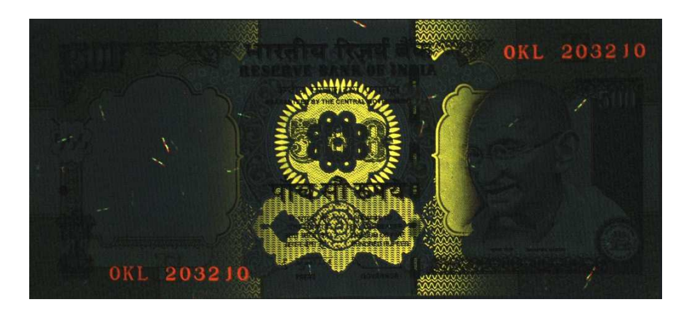
Figure 4. UV image.