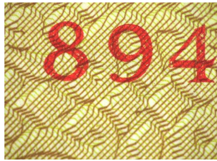
Figure 6. Images IMG_16 (left) and IMG_18 (right).