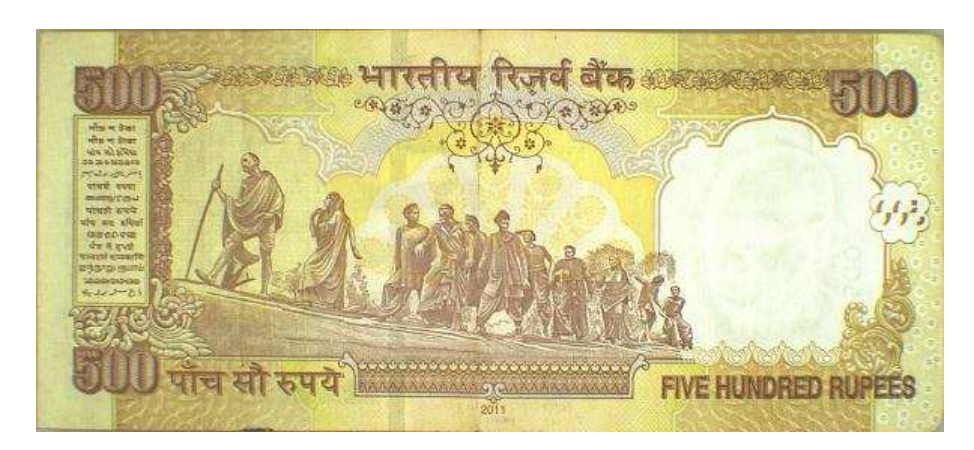
Figure 7. Image IMG_19.