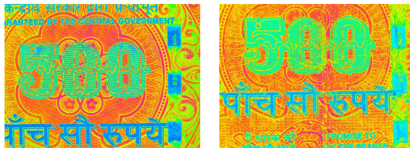
(a) Genuine note.