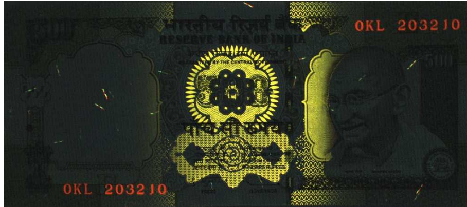
Figure 4. UV image.