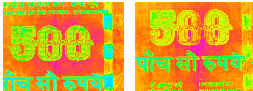
(a) Genuine note.