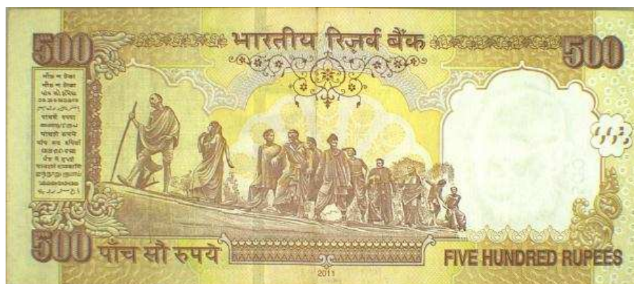
Figure 7. Image IMG_19.