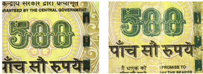
(a) Genuine note.