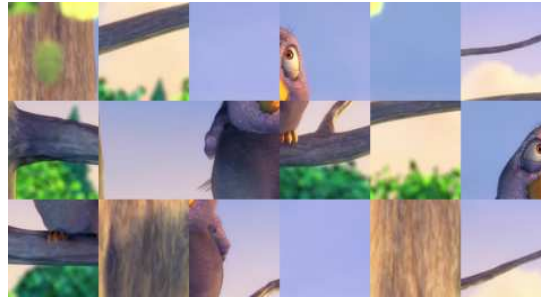
Fig.1. Mosaic/Jigsaw game example

both players and spectators can take part. Indeed, as the games are ongoing, spectators are free to interact as they wish, perhaps just waving to people or even talking to people at the remote locations. This, in turn, may shape players' behavior.