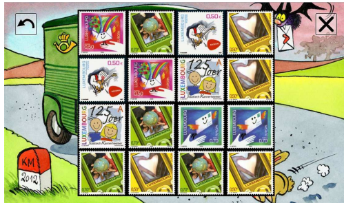
Fig.3. Memory game example: stamps

Quizzes are another popular format and are again applied with LiveCity, in the example (see Fig.4) (known as “Whose phone is it?”) players are asked to match the phone with the right person. In this case, multi-touch is used to drag the images around. While players may be able to guess some of the answers for this, other quizzes’ players may also need to spend time finding out about contents in the museum. Additionally, this approach encourages the exchange of information between the two museums as players could be quizzed on content in the other museum. This would necessitate that players find out and discuss content together.