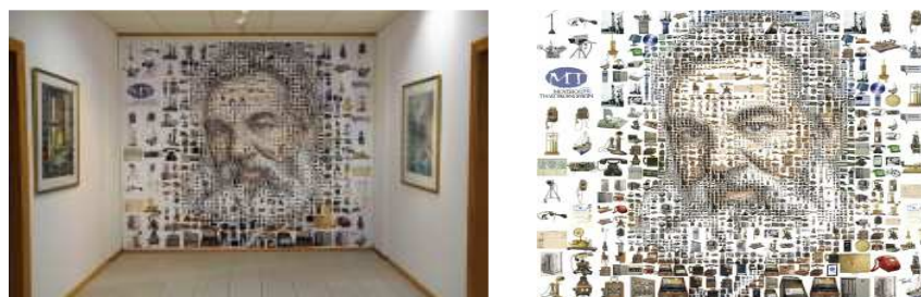
Fig.5. The Alexander Graham Bell “build together” game concept

The building together game starts by showing the players an image of an object (e.g.: a museum exhibit, art piece, building, or something else), which is then split into several parts which, in turn , are randomly rotated, resized and mixed. The objective is to “build” the original object from its parts. On the first floor of the OTE’s Museum in Athens there is a wall-to-wall poster of Alexander Graham Bell, which consists of dozens of the Museum’s exhibits and could be easily used for the purposes of this specific game ( as shown in Fig.5 ). Multi-touch interaction enables an arbitrary number of players to collaborate in the game. Collaboration with the remote players will be facilitated by the live v2v link between game sites. Multi-touch interaction enables an arbitrary number of players to collaborate in the game. Collaboration with the remote players will be facilitated by the live v2v link between game sites.