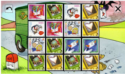
Fig.3. Memory game example: stamps

Quizzes are another popular format and are again applied with LiveCity, in the example (see Fig.4) (know as “Whose phone is it?”) players are asked to match the phone with the right person. In this case, multi-touch is used to drag the images around. While players may be able to guess some of the answers for this, other quizzes’ players may also need to spend time finding out about contents in the museum. Additionally, this approach encourages the exchange of information between the two museums as players could be quizzed on content in the other museum. This would necessitate that players find out and discuss content together.