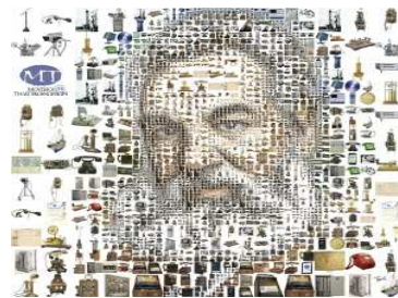
Fig.5. The Alexander Graham Bell “build together” game concept

The previous games use the multi-touch table and video feed from a static location in the museum which could result in people being drawn away from the museum