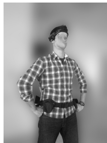
Fig. 1. Equipped Member

Initially developed for emergency first responders - namely paramedics units deployed in emergency ambulances - so as to provide a balanced compromise between computational resources (necessary to acquire, encode and transmit live HD video), mobility (wearable device, battery autonomy and hands-free operation) and good performance under extreme conditions, mostly due to the inclusion of rugged devices, video camera able to self-adjust to variable lighting environments and to the possibility of integration with emergency responders equipment, as shown in Figure 1.