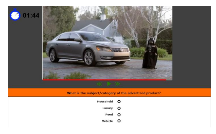
Fig. 3. The 'House of Ads' quiz mode

The game will be available online and accessible by anyone. Social media and popular networks will be exploited for its dissemination and diffusion. The game will be evaluated according to several aspects. Its usability and engagement will be tested through interviews and questionnaires handed out to a group of players, in combination with the talk aloud protocol, used extensively for the evaluation of the usability of interfaces. Another evaluation aspect is whether the game does indeed manage to populate the proposed ontology. Further evaluation metrics to determine the success of the approach may include: mean times played and number of successful annotations per player, percentage of incorrect answers, etc.