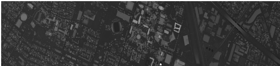
Fig. 2. LIDAR image of the study area