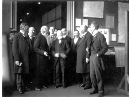
Figure 5: Andrew Carnegie's visit to the "Palais mondial", Cinquantenaire, Brussels, 1913 (collections of the Mundaneum)

The Mundaneum, birthplace of international institutions dedicated to knowledge and brotherhood, became a universal documentation centre over the course of the 20 th century. Its collections, comprising thousands of books, newspapers, small documents, posters, glass plates, postcards, and bibliographic records were gathered and stored in different locations around Brussels, including the Palais du Cinquantenaire, built in 1880 to celebrate the 50 th anniversary of Belgium's independence.