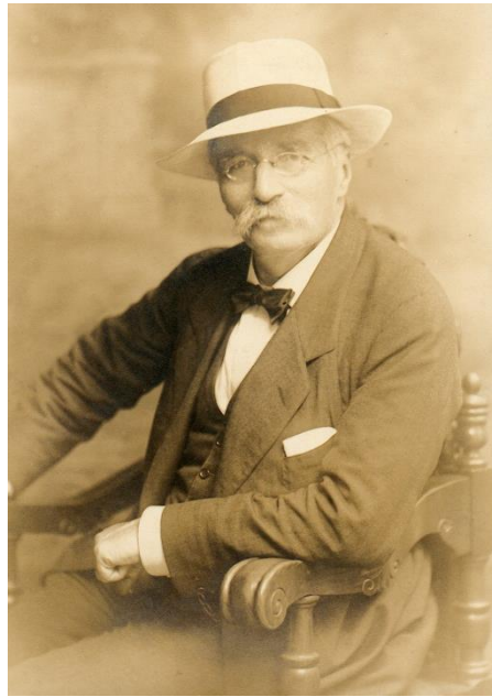
Figure 2: Henri La Fontaine, Nobel Prize for Peace in 1913

science of modern information management is not limited to just this classification system.