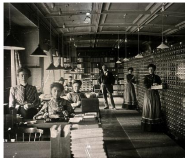
Figure 3: The Universal Bibliographic Repertory, Brussels, 1910

Paul Otlet, who is recognised as the father of documentation, was the first to conceptualise and devise a classification tool which digitised access to knowledge. Considering the notion of information as independent from its medium but also the need to come up with powerful means of transmitting this information, he created blueprints for many systems between 1900 and 1935, each more visionary than the next. As a result, Paul Otlet left us with many drawings and descriptive notes of what technology would become a century later: the video conference, the conference call,