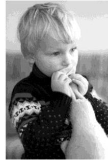
Fig 6: A toy that has become very ‘real’

When it was first introduced in the late 1970s many people saw the Apple II as a toy and not a ‘real computer’. It was not until VisiCalc software appeared on the Apple II that people started to consider it to be real and relevant for more than game playing. Victor Frankenstein’s creation [18] never became real in his novel. But if Frankenstein’s monster never succeeded in becoming real in this way, in many ways it has become real, even if only as a concept, in our world as we have found a use for the analogy of Frankenstein’s monster to describe any ‘unnatural creation’ of modern technology [2]. Returning to the Velveteen Rabbit: