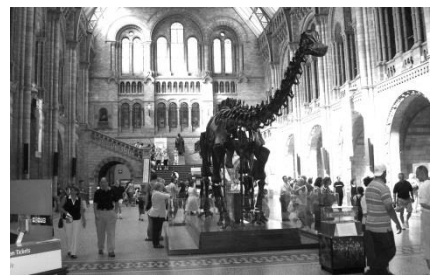
Fig 3: Dinosaur skeleton in a museum

To many children, Palaeontology (the scientific study of prehistoric life) is real and relevant because of the romance of the dinosaur. The film 'Jurassic Park' was a good start and David Attenborough's 'Walking with Dinosaurs' TV program and exhibition did much to popularise the dinosaur. Watching children move through the Walking with Dinosaurs exhibition and observing the model dinosaurs moving, the relevance of dinosaurs to them can readily be seen. Added to this the sheer size of dinosaur skeleton bones, like the one in the entrance to the Natural History Museum in London, make it hard not to develop some interest. Many children have also been given a dinosaur toy at some stage or have seen the Flintstones or Dorothy the Dinosaur on television. For children, dinosaurs