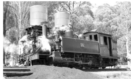
Fig 5: Puffing Billy, Melbourne

Although there are few places in the world where steam trains still operate there is a certain romance about them that many people find attractive and interesting. They find displays and even trips in these steam trains act to make them very relevant. This relevance is due mainly to the provision of an interesting experience but perhaps also to their size and to the noise and steam they emit. Likewise displays and processions of vintage cars have a natural romance that many people find attractive and that make these machines something that is relevant to them.