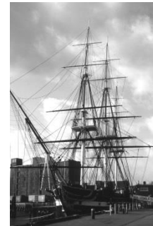
Fig 2: USS Constitution

Their history is relevant to most Americans partly due to a number of national holidays representing real events in American history: Columbus Day (remembers Christopher Columbus' arrival to the Americas on October 12, 1492), Martin Luther King Day (celebrates the life and achievements of an influential American civil rights leader), Independence Day (commemorating the adoption of the Declaration of Independence on July 4, 1776), Presidents' Day (Washington's Birthday, Feb 18), Memorial Day (commemorates all men and women, who have died in military service for the US) and Veterans Day (November 11). US children also are taught a lot about their past Presidents (and can probably recite the list), their origins, their history, their independence, the civil war and about many other aspects of their country. Their history has been made very real and relevant to them because of formal education and of listening to interesting stories as well as being able to visit historic sites and make use of interactive displays and simulation games. This is in addition to their being reminded of this history by the names of US public holidays.