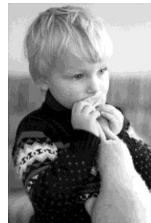
Fig 6: A toy that has become very ‘real’

Does the history of computing become real and relevant when people really ‘love’ it? Perhaps it becomes real when they find what they see as a significant place for it that fits into their own world.