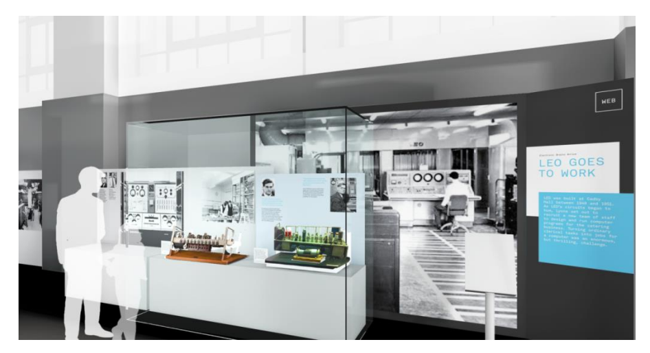
Figure 4: Representation from Universal Design Studio of one part of the Lyons Electronic Office (LEO 1) story on the Information Age gallery, 2013.

We hope that this type of story and user-centric approach will create personal links for visitors and enable a dialogue with a broader audience than those already engaged with the history of computing. It should enable visitors to reflect on what the technology meant to our predecessors, and how these meanings are not given and defined by the technology, but are co-constructed with users in the way that they are consumed, marketed, used and re-appropriated.