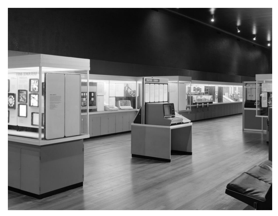
Figure 1: Science Museum's gallery Computing Then and Now , 1975, showing the computer terminal that allowed visitors to interact with the Imperial College computer.

The Science Museum's own computing gallery, Computing Then and Now , which opened just a few years later in 1975, is another interesting example of how contemporary ideas about computing were mapped onto a gallery space.