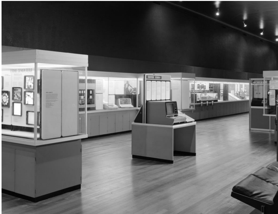
Figure 1: Science Museum's gallery Computing Then and Now , 1975, showing the computer terminal that allowed visitors to interact with the Imperial College computer.

The Science Museum's own computing gallery, Computing Then and Now , which opened just a few years later in 1975, is another interesting example of how contemporary ideas about computing were mapped onto a gallery space.