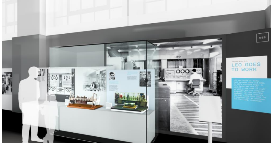
Figure 4: Representation from Universal Design Studio of one part of the Lyons Electronic Office (LEO 1) story on the Information Age gallery, 2013.

We hope that this type of story and user-centric approach will create personal links for visitors and enable a dialogue with a broader audience than those already engaged with the history of computing. It should enable visitors to reflect on what the technology meant to our predecessors, and how these meanings are not given and defined by the technology, but are co-constructed with users in the way that they are consumed, marketed, used and re-appropriated.